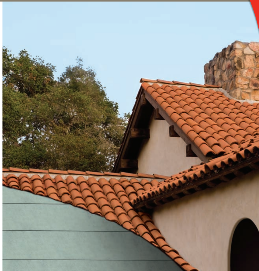
Excellent surface for foam adhesive set and mechanically fastened roof tile applications.