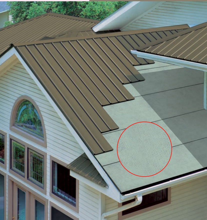
Withstands temperatures up to 260°F without fusing or degrading overlying metal roofing. Approved for use under all metal roof systems, including copper and zinc.